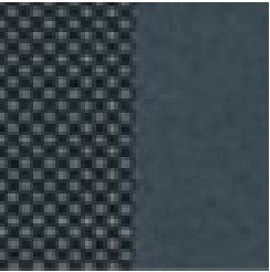
TEP Pierce / Vesuve Gris