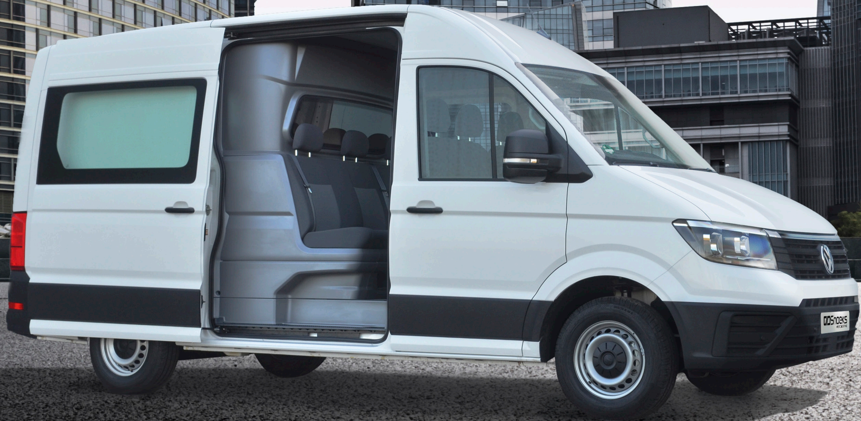
VOLKSWAGEN CRAFTER Crew Cab