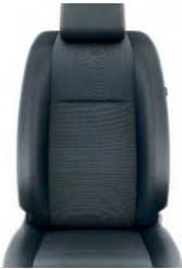
Dark grey with PVC