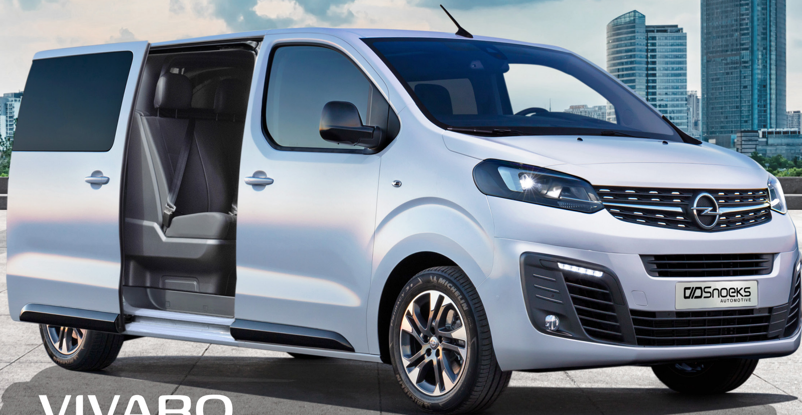
OPEL VIVARO Crew Cab