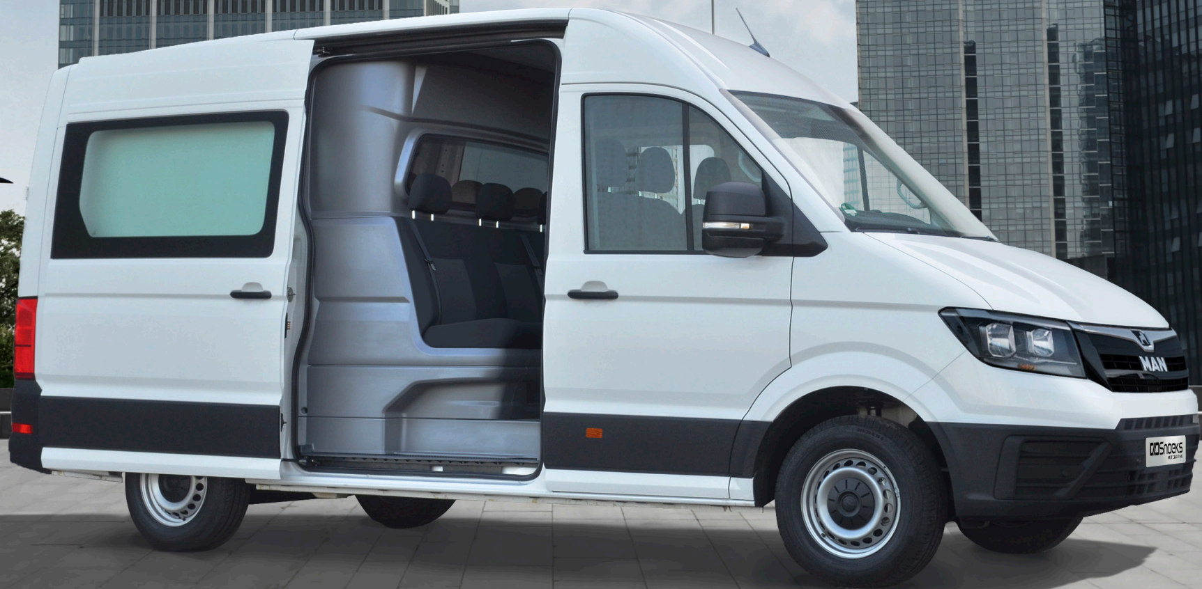
MAN TGE Crew Cab