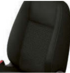
Trend & Limited