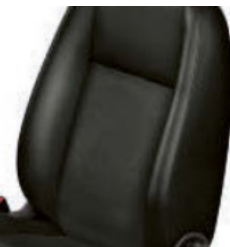
Ambiente & Trend