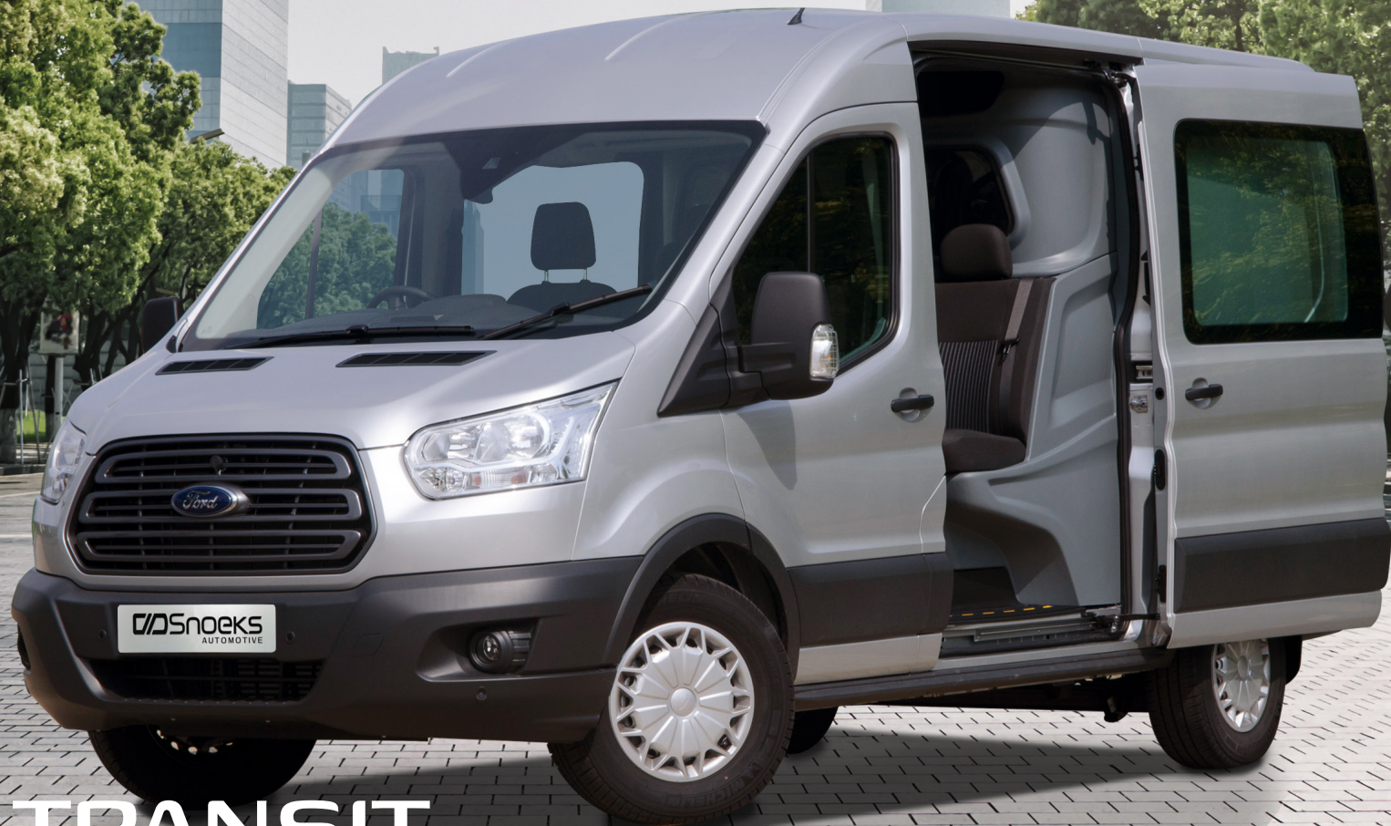
FORD TRANSIT Crew Cab