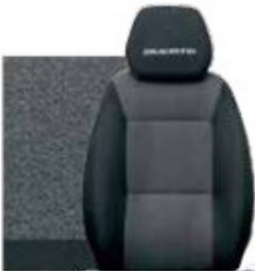
Grey Crêpe fabric (157)