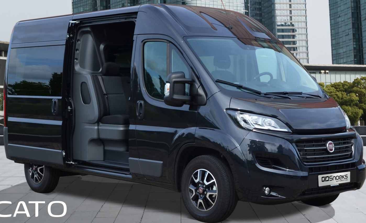
FIAT DUCATO Crew Cab