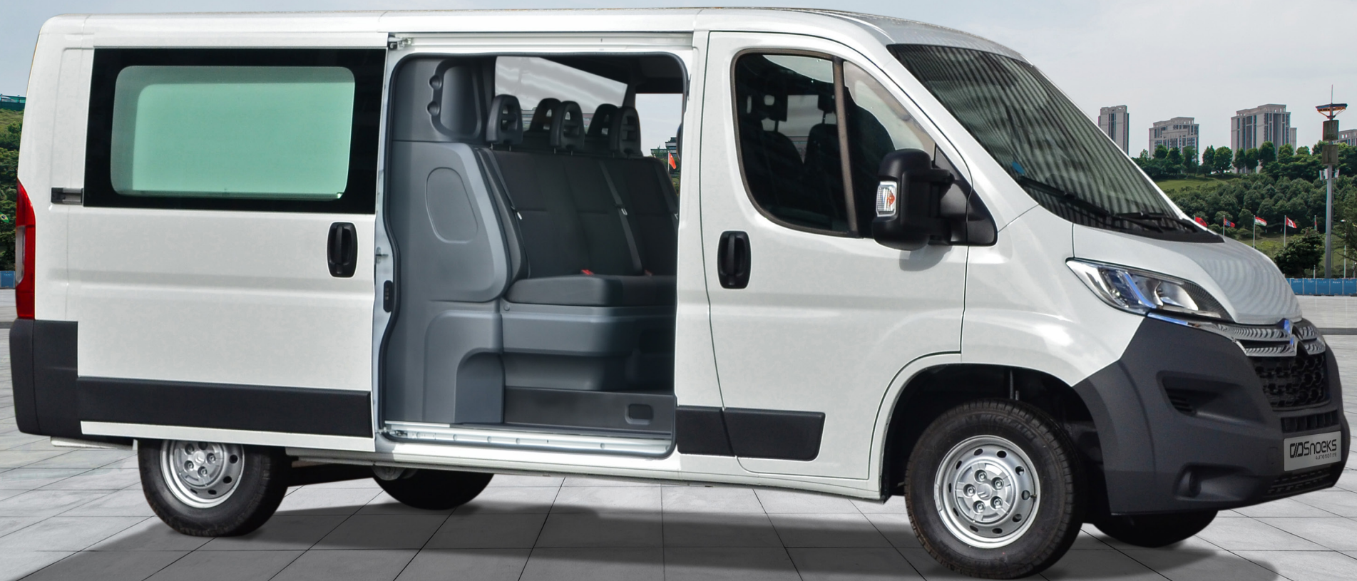
CITROËN JUMPER Crew Cab